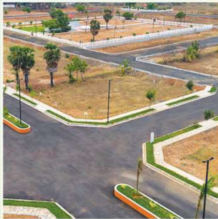
30 FEET BT ROADS