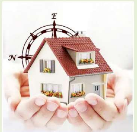
100% VASTHU & CLEAR TITLE