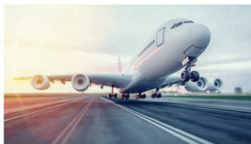
Bhogapuram Inter National Airport