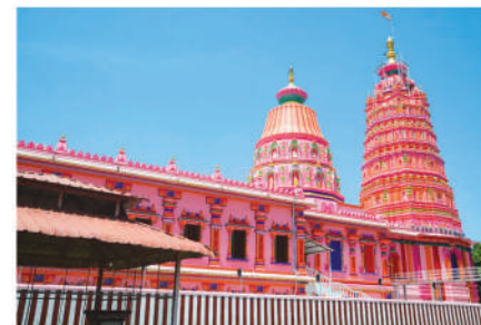
Govindhapuram Krishna Mandir