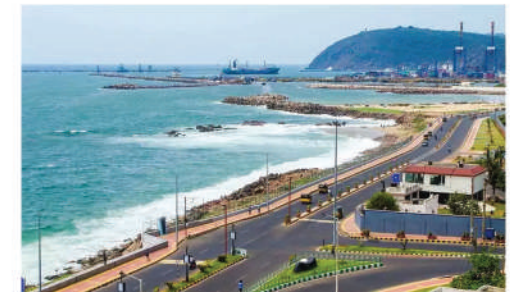
Coastal Corridor Road